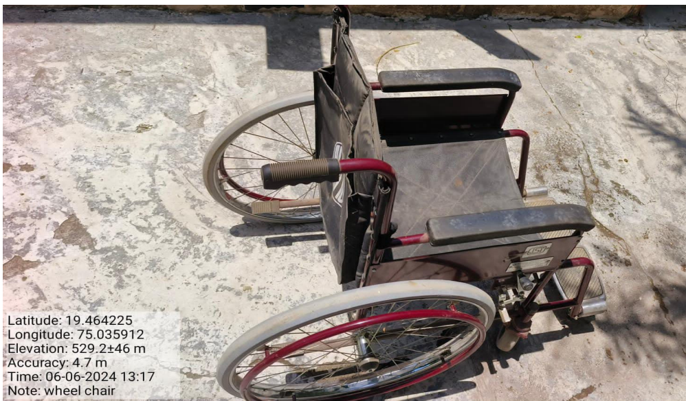
Wheel Chair for Divyangana