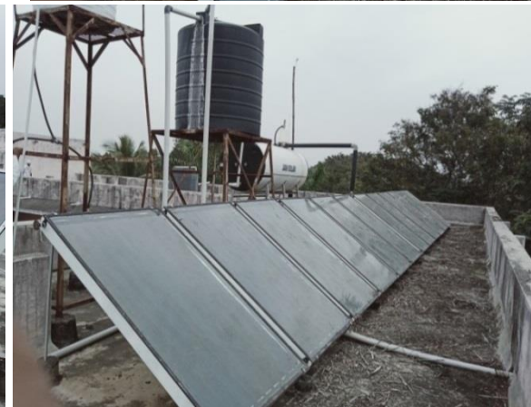
*Solar Energy Plant for Hot Water System in Ladies Hostel