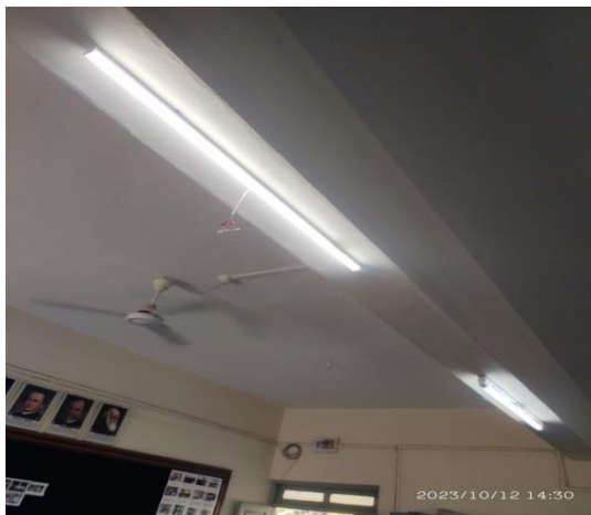
Replace LED tubes