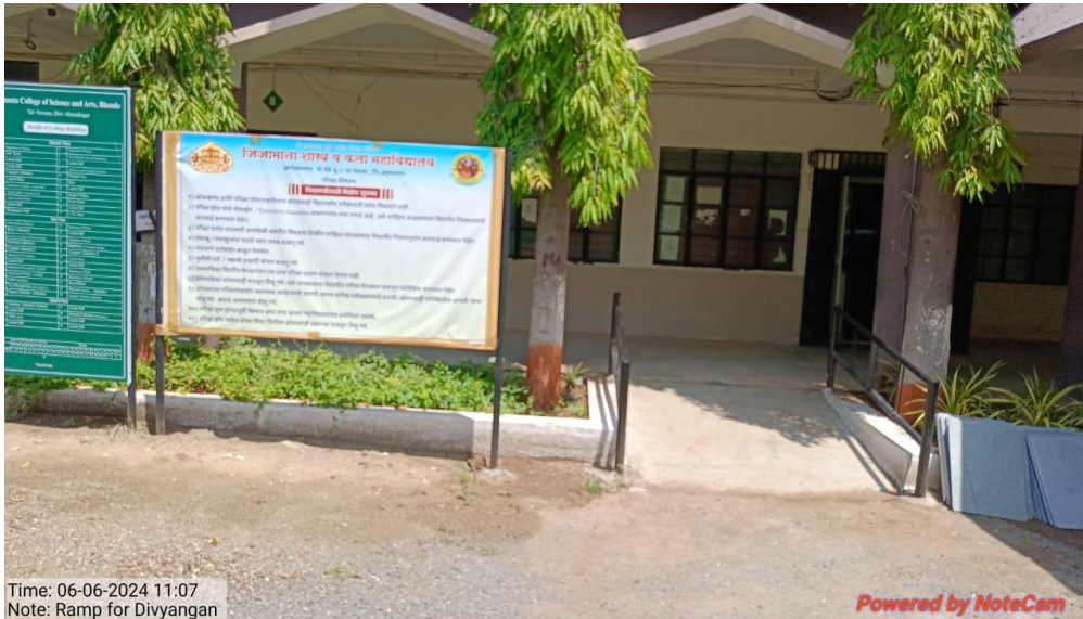
Ramp for Divyangjan