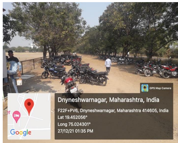
Restricted entry for Vehicles