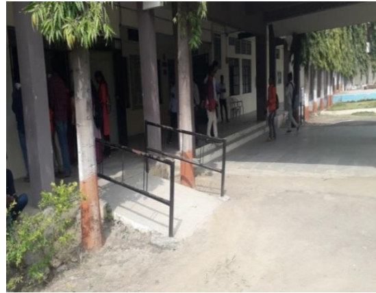
Ramps for Divyangjan